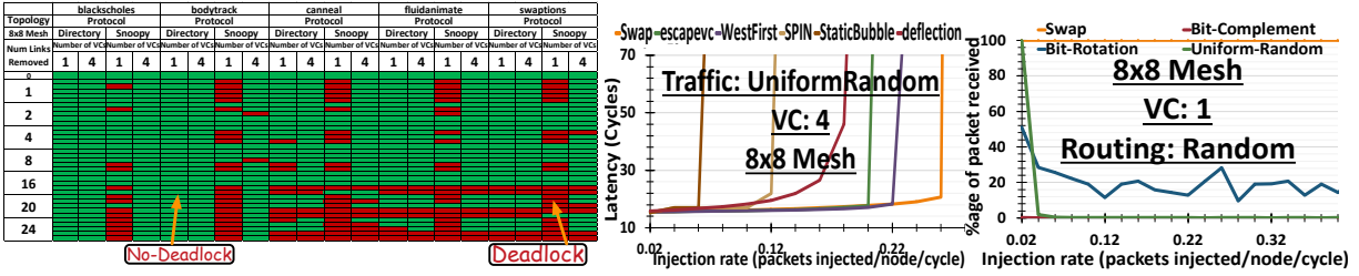
(a) Figure shows the results from full system simulations ran on gem5 in which parsec-applications incur deadlock, for both recovery ( spin , static_bubble ) and deadlock-avoidance ( west-first ) scheme. snoop and directory based cache coherence protocol. Underly-Right-graph shows the correctness of swap-technique when applied to basing irregular topology is derived from 8x8 Mesh after disabling line random-routing, as all the packets are ejected from the network. However without swap-technique baseline routing incurs deadlock.